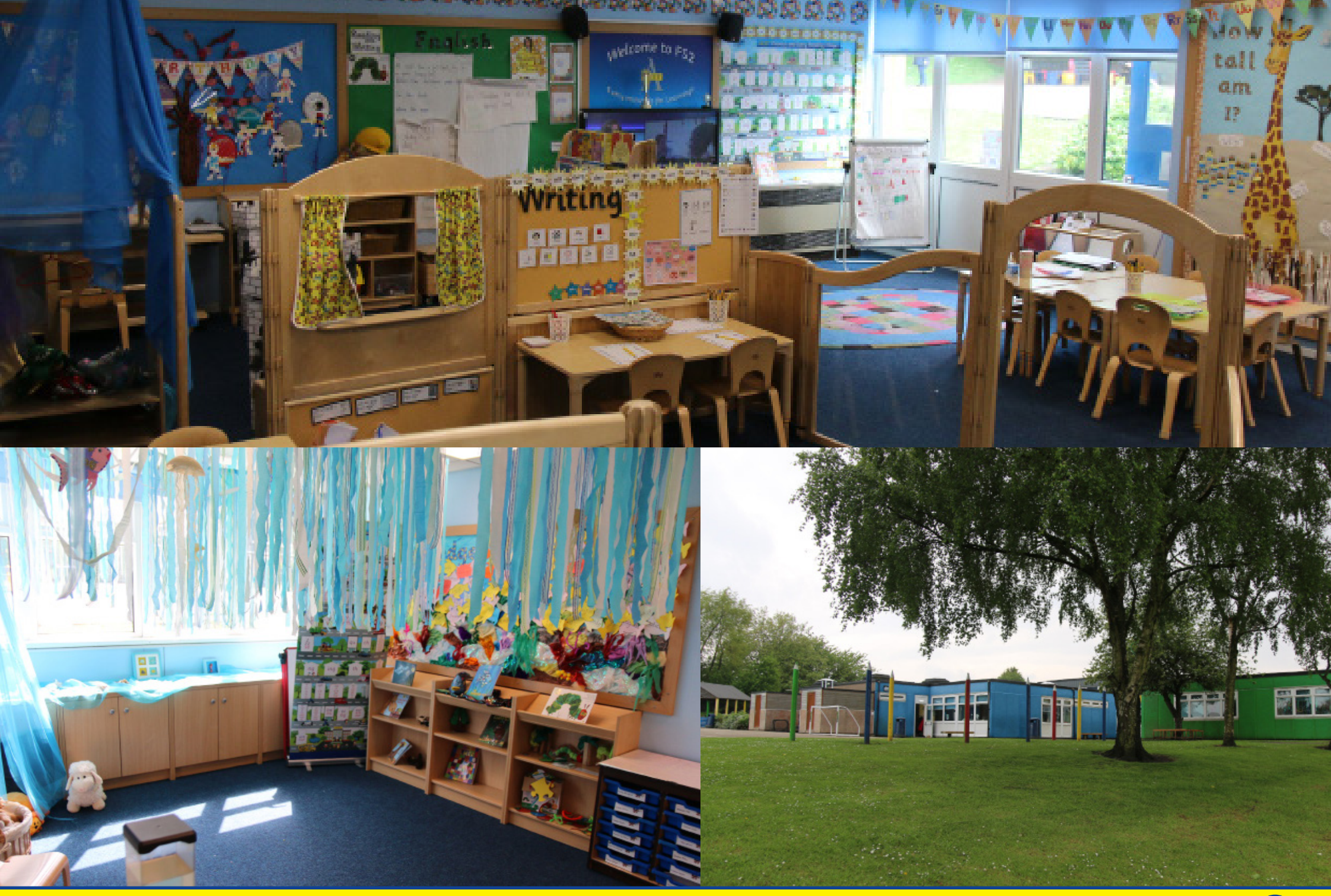
Aughton - every minute is for learning